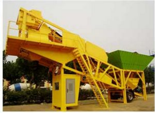
Installation of YHZS75 mobile concrete mixing plant