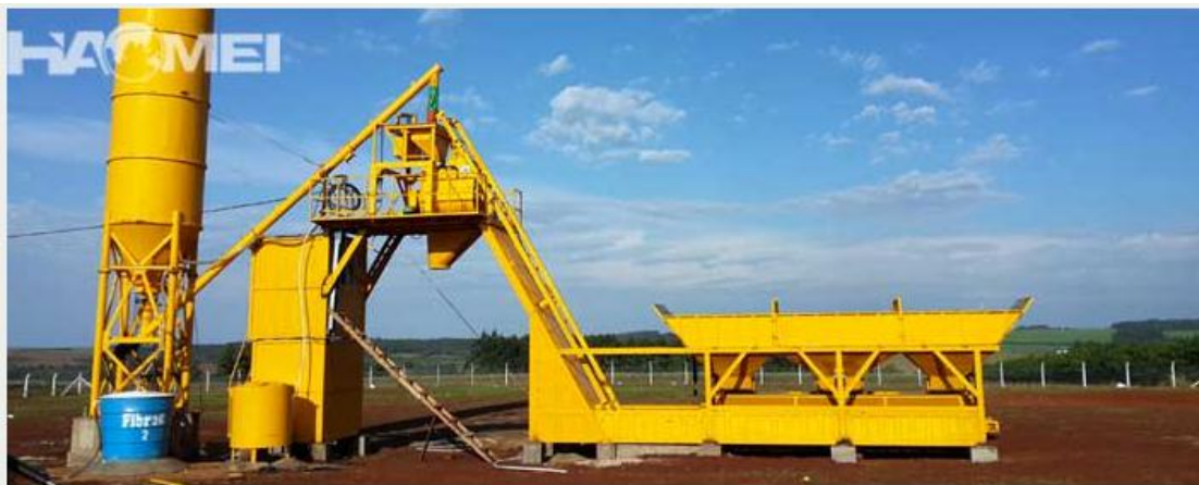
General layout of YHZS25 mobile concrete batching plant

YHZS25 mobile concrete batching plant is a new type ready mix batching equipment which is movable by trailing. It is uniquely and novelly designed with a simple and compact structure. One trailing unit assembles a whole working set of aggregating, weighing, conveying and mixing system, enabling it great overall mobility. By absorbing new technologies from overseas and domestic, The mobile concrete batching plant has such characteristics as accurate weighing, homogeneous and efficient mixing, fast and clean delivery, convenient to move and operate, safe trailing, etc. It is the ideal choice for projects that require frequent movement from one construction site to another.